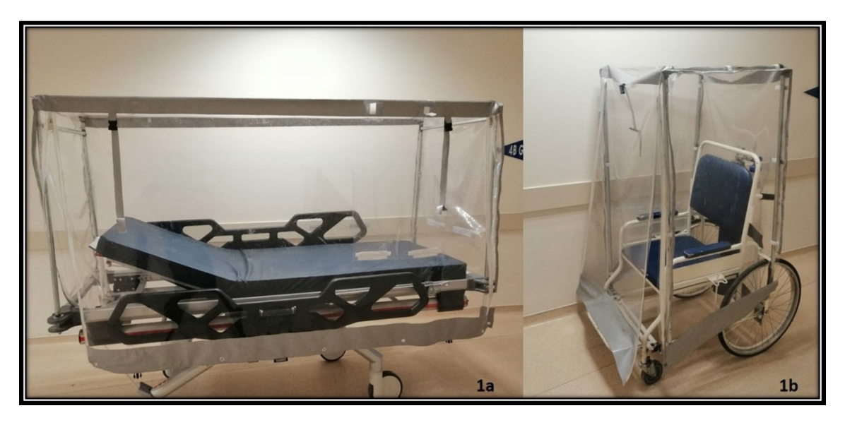
Figure 2. Transparent cover transport vehicles used for the isolation and transfer of COVID-19 patients within healthcare facilities. 1a. Patient stretcher and 1b. Wheelchair

While they brought me to the room from the intensive care unit, they had covered the stretcher with plastic. People in the hallway looked on as I was on that stretcher. I felt very bad at that moment. Interviewee 4